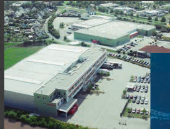
anona facility 2 and 3