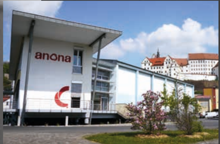
anona facility 1